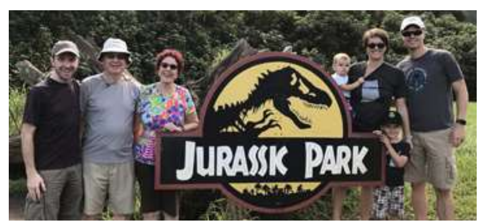
The Dixon family at Kualoa Ranch on Oahu where scenes from Jurassic Park were filmed.