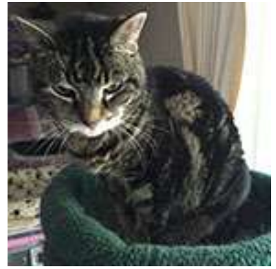
Isis – 16 years old